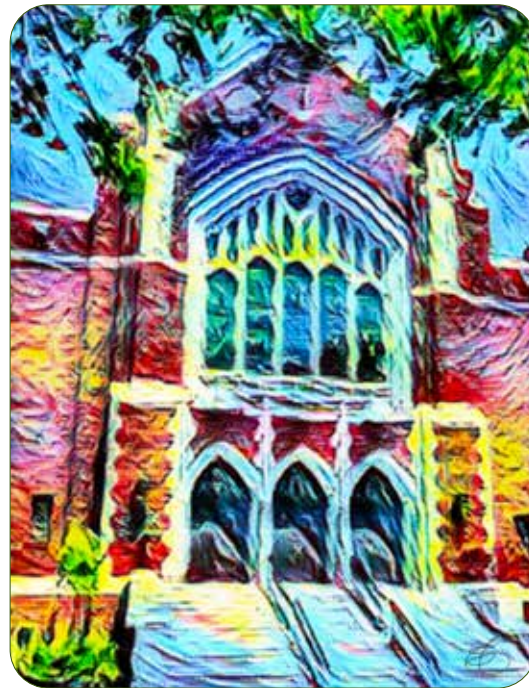
Sanctuary Building art by Shea Firnberg

in the Revolutionary War and brought their families to settle on the land. Under Spanish rule, adult Protestants could worship as they wished but no more than eight persons could attend. All children were required to be baptized by a Catholic priest and be raised in the Catholic faith. Protestant ministers were not permitted to preach, baptize, or perform marriages or funerals. Those who did, were sent to Spain to stand trial. In addition, only Catholics were allowed to settle within Spanish domain. Those who were not Catholic were required to renounce their religion and convert.